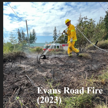
Evans Road Fire (2023)

2023, as a whole, is proving to be an exceptional fire season. On June